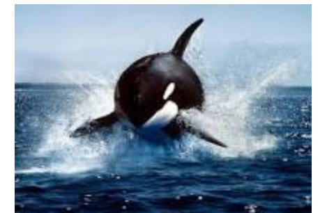
Southern resident killer whale