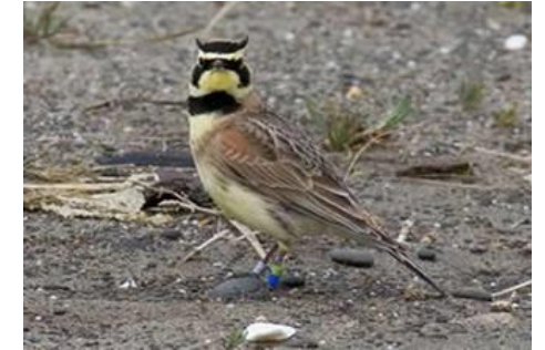
Streaked horned lark